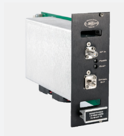
1914 Plug-In Style Module