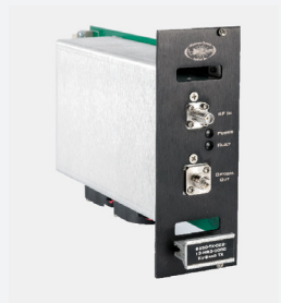
1914 Plug-In Style Module