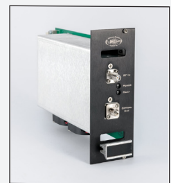
1914 Plug-In Style Module