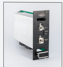
1914 Plug-In Style Module