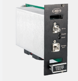
1914 Plug-In Style Module