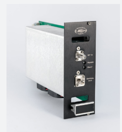
1914 Plug-In Style Module